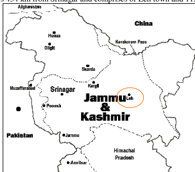
Figure 2: Location of Leh District in Jammu & Kashmir

Leh District, where Nimoo Bazgo Project is located, within Jammu & Kashmir State can be seen in Figure 2. Leh district is 434 km from Srinagar and comprises of Leh town and 113 villages.